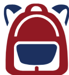
Enrollment & Registration